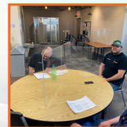
ArmorBoss™ X-Shape Table Shield