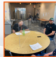
ArmorBoss™ X-Shape Table Shield