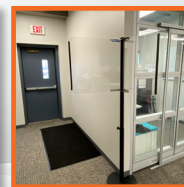
ArmorBoss™ Floor Stand Shield