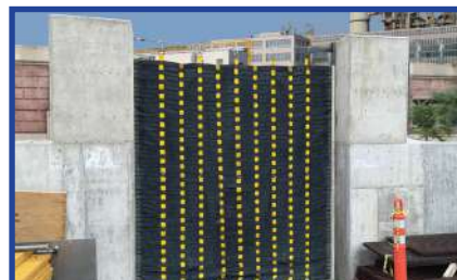
Formerly called the Flex-Wall®

This is a high-strength fabric wall that deploys vertically, rapidly providing flood protection around and between buildings, across doors of any size or in front of glass.