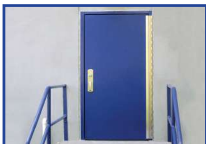
Pedestrian Flood Door (PD-520)