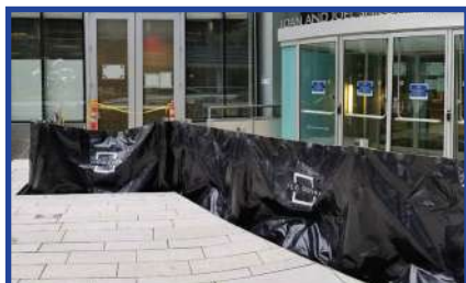
Formerly called the Flex-Wall®

Now from PS Flood Barriers (formerly products of ILC Dover), Flex-Gate® and Flex-Cover® flood barriers are constructed using a revolutionary combination of high-strength textiles and corrosion-resistant hardware. They can all be deployed in minutes by just one or two people. Plus, the point-of-use storage offered by these products is an important element in many flood protection strategies.