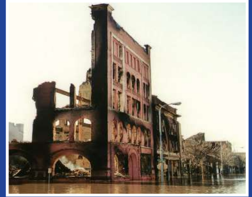
Grand Forks, North Dakota, 1997