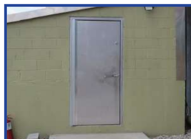
Mechanical Room Flood Door (PD-525)