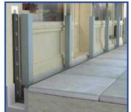
Cover At Grade