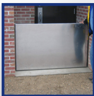
Lift-Out Flood Barrier