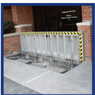
Bottom Hinge Flood Barrier