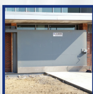
Sliding Flood Barrier