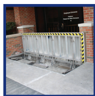
Bottom Hinge Flood Barrier