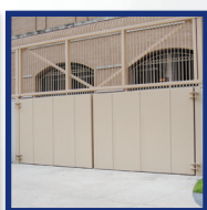
Hinged Flood Barrier