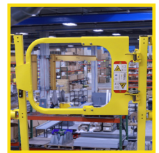
EdgeHalt® Ladder Safety Gate