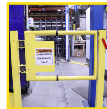
EdgeSafe® Personnel Access Gate