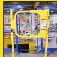
Edgehalt® Ladder Safety Gate