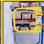
Edgehalt® Posi-Stop Ladder Safety Gate