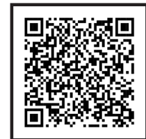
Scan for Measuring Guide & Order Form

Available in 3 Finishes - Powder Coat Yellow (PCY), Hot-Dipped Galvanized (GAL), 304 Stainless Steel Seal Welded (304SW)