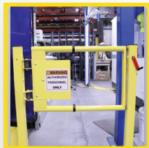
EdgeSafe® Personnel Access Gate