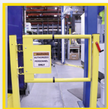
EdgeSafe® Personnel Access Gate