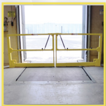
EdgeSafe® Smart Gate