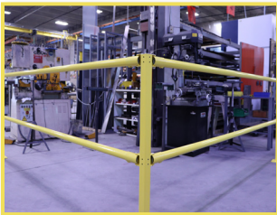
Ground-Level Area Protection