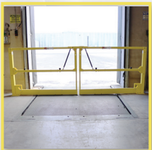
EdgeSafe® Smart Gate

EdgeSafe Safety Railing is compatible with all PS Safety Access products