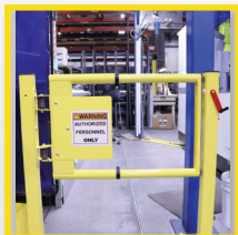
EdgeSafe® Personnel Access Gate