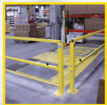
EdgeSafe® Smart Gate