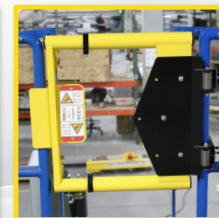
EdgeHalt® Adjustable Safety Gate