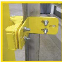
ANGLE IRON ADAPTER BRACKET (AC-2206)