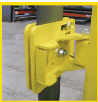
FLAT BAR ADAPTER BRACKET (FB-2205)