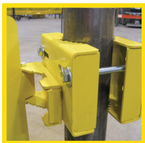
LARGE PIPE ADAPTER BRACKET (LP-2204)

Compatible with the EdgeHalt® Single or Full Height Ladder Safety Gate, this adapter bracket is for customers with unique mounting needs.