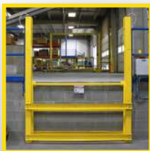
SafeMezz® Downward Gate