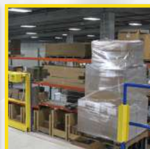
SafeMezz® Horizontal Gate

701.746.4519 | 877.446.1519 | www.pssafetyaccess.com | 4psinfo@psindustries.com