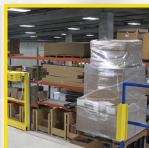
SafeMezz® Horizontal Gate

In applications where the product is positioned to protect a fall-edge, the person operating the product is required to implement another primary means of fall protection whenever the product is not closed.