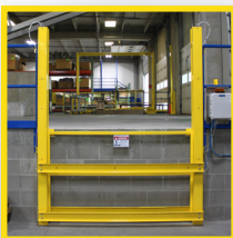
SafeMezz® Downward Gate