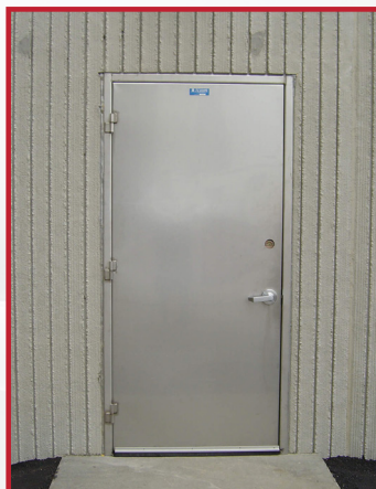
Stainless Steel (304-2b) Swing Door and frame