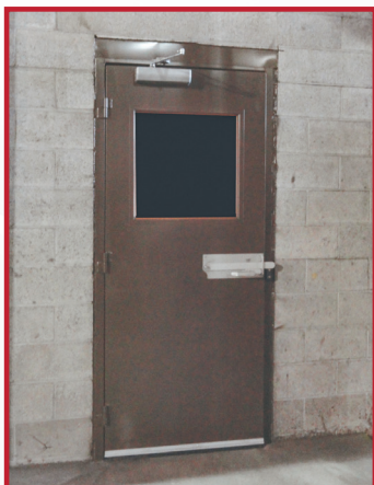
Single Swing Door with bar latch