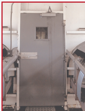
Single Swing Door with strip hinge for installation on existing frame