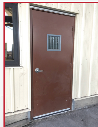
Single Swing Door with cylindrical lock set

701.746.4519 | 877.446.1519 | www.psaccesssolutions.com | 4psinfo@psindustries.com